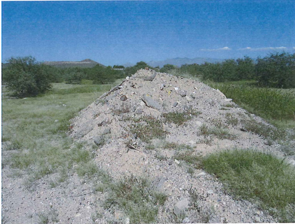
Photo 5: Miscellaneous soil and debris dumped on central cap – looking north