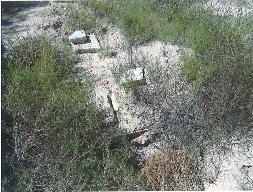
Photo 3: Localized surface cracking and subsidence near northwest corner