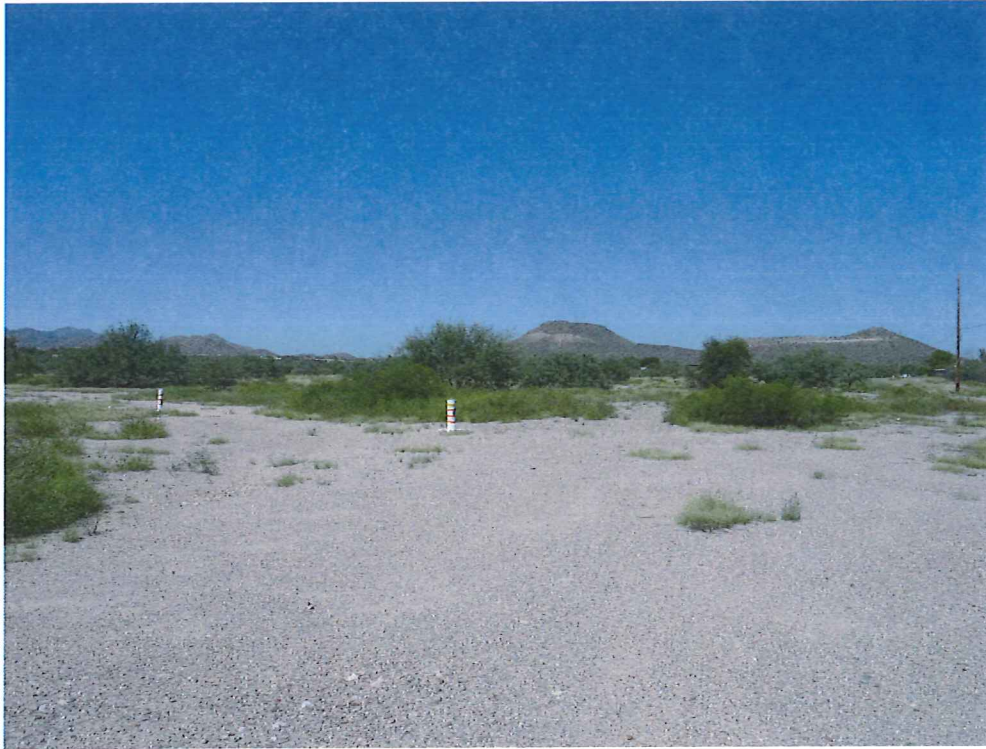
Photo 1: View of landfill cap with gas monitoring wells – looking north